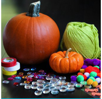
DIY Night Light & Kids Pumpkin Decorating