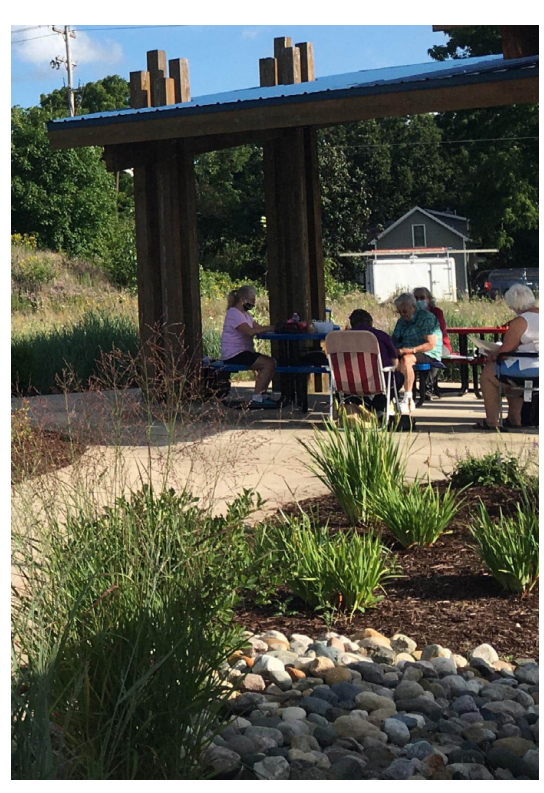
TOPS outdoor meeting