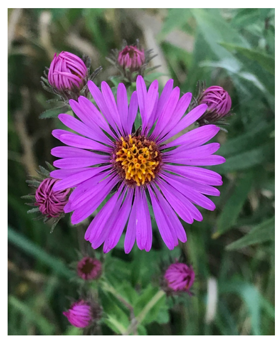
PRESERVE at AL!VE