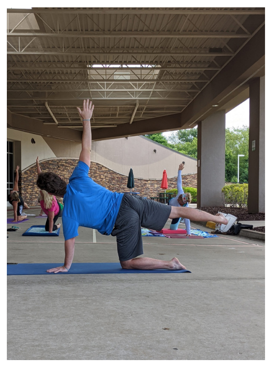
Yoga: Basic, outdoors

7 a.m. - 7:55 a.m.Thurs., Sept. 24 7 a.m. - 7:55 a.m. Tues., Sept. 29 7 a.m. - 7:55 a.m. Sun., Oct. 4