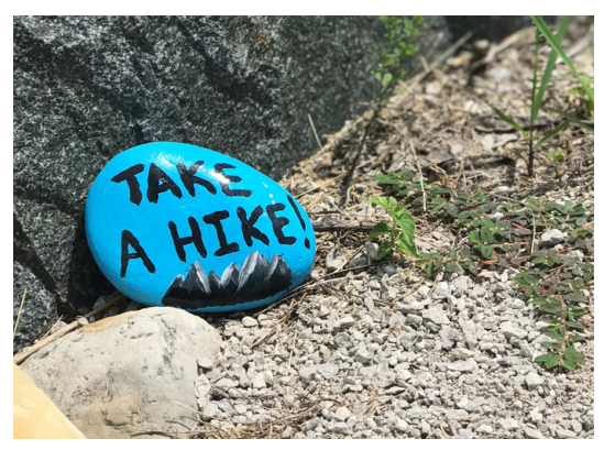
Painted rocks along EXPLORE outdoor

Call (517) 541-5800, opt. 6, to register or to create an account.