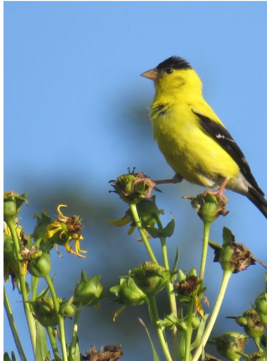
Goldfinch in PRESERVE