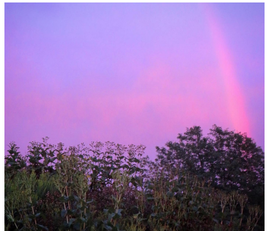
PRESERVE at dusk