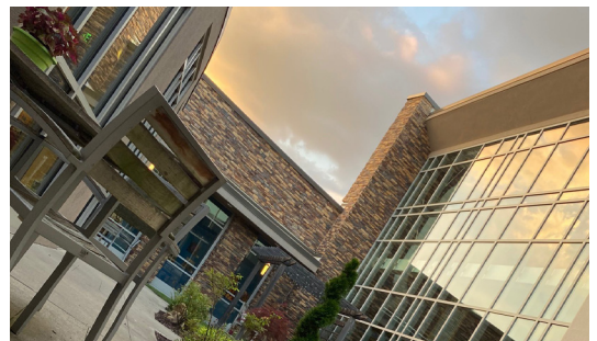
PONDER (where JEM Book Club takes place)