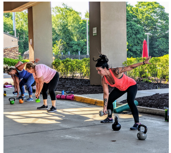
Kettlebell Circuit outdoors