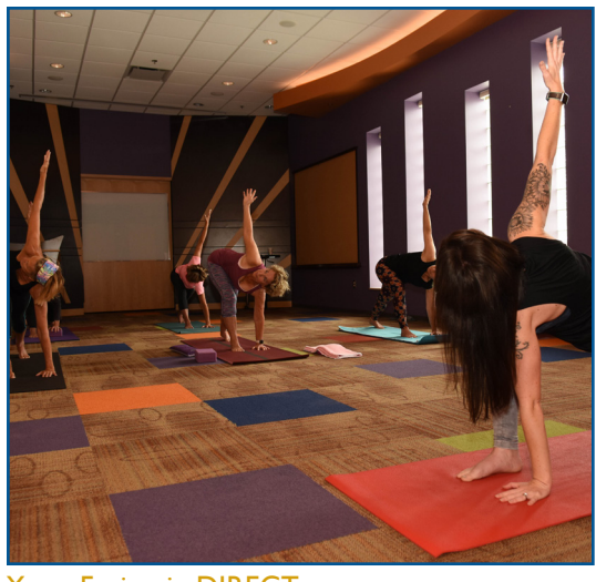
Yoga: Fusion in DIRECT