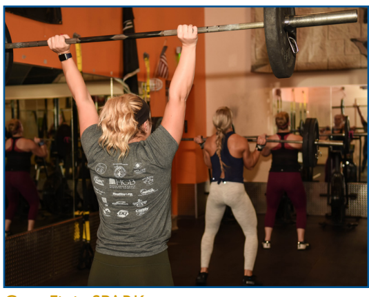
CrossFit in SPARK