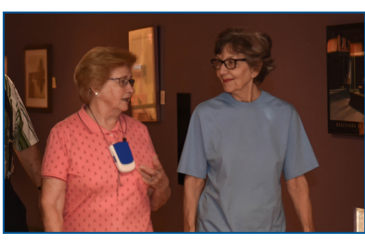
Walkers on EXPLORE

5:30 a.m.-9 p.m. Indoor & Outdoor Walking 30-Minute Blast (GR) 5:45 a.m.-6:15 a.m. 5.45 a m -6.45 a m CrossFit 5:45 a.m.-7 a.m. Basketball: All Ages Drop-In 6:15 a.m.-6:30 a.m. 15-Minute Abs (GR) 7 a.m.-9 a.m. Pickleball 9 a.m.-9:50 a.m. Tabata Bootcamp (CI) 9 a.m.-10 a.m. CrossFit 10 a.m.-10:45 a.m. Fun Fitness (AT) 10 a.m.-10:50 a.m. CardioFix/Pilates Plus (CI) 10 a.m.-10:55 a.m. Yoga: Basic (JD) 11 a.m.-11:30 a.m. Foam Roller (MS) 11 a.m.-11:45 a.m. Barre None (DD) 12 p.m.–1 p.m. Basketball: Adult Drop-In 12 p.m.–1 p.m. Group Cycling: Virtual Ride I p.m.-2:45 p.m. Pickleball Basketball: Teen Drop-In 3 p.m.-5:30 p.m. 4:30 p.m.-5:30 p.m. CrossFit 4:45 p.m.–5:30 p.m. Tabata Bootcamp (DD) 5:30 p.m.-6:30 p.m. CrossFit 6 p.m.-8:55 p.m. Basketball: All Ages Drop-In