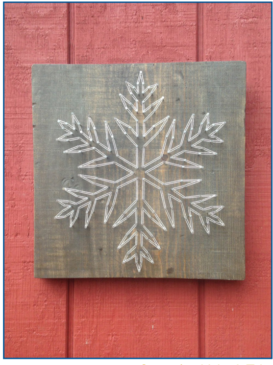
String Art Make & Take