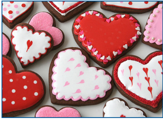
Baking with Kids: Valentine Cookie Bouquets