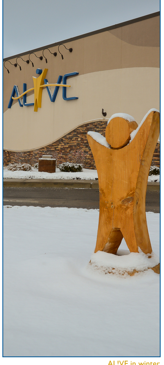
AL!VE in winter

6:40 p.m.–7:40 p.m. Yoga: Power (NH) 6:45 p.m.-8:55 p.m. Basketball: Adult Drop-In