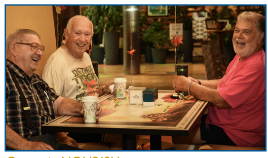
Guests in NOURISH