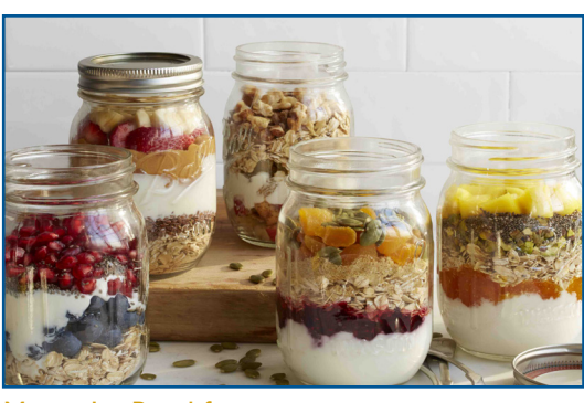
Mason Jar Breakfasts