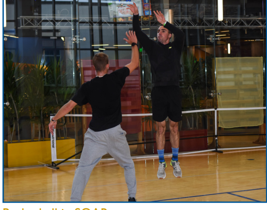
Basketball in SOAR

NOTE: 9- to 12-year-olds can attend Bootcamp, PiYo and Zumba classes with their parents or guardians FREE with a GROW membership.