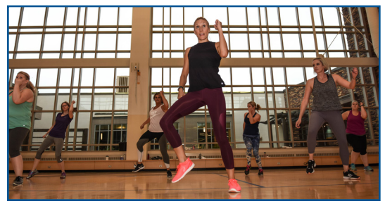
Cardio Hip Hop in SOAR