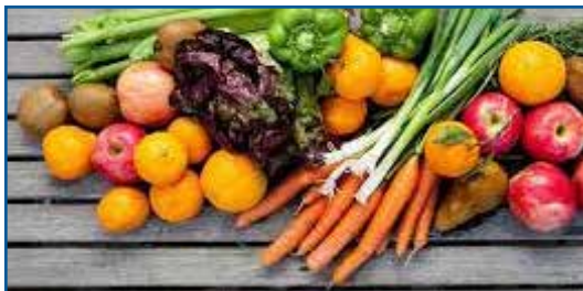
One Day to Wellness

Cost: FREE Mon., Nov. 20 5 p.m. – 7 p.m. Tues., Nov. 21 10 a.m. – 12 p.m.