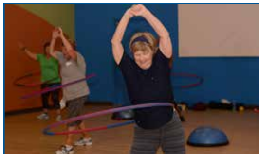
Cardio Fix/Pilates Plus in ENERGIZE