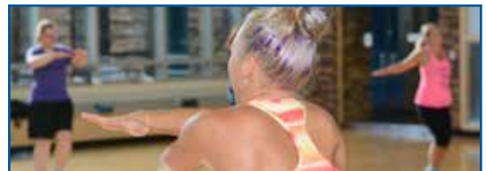
R.I.P.P.E.D. in SOAR