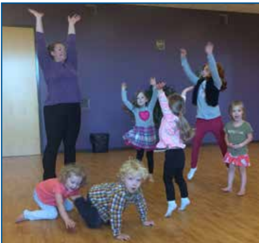
Zumba Kids in LEARN