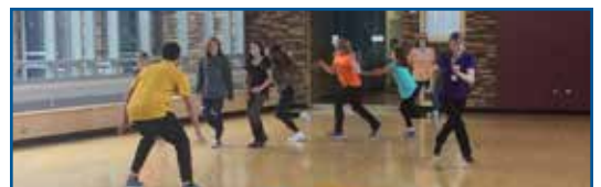
FITKids in SOAR