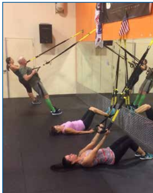
TRX/Kettlebell Combo in SPARK

*Eaton Area Senior Center Members: $20/six-week session