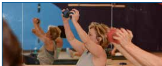
Jem Strength & Stability in ENERGIZE