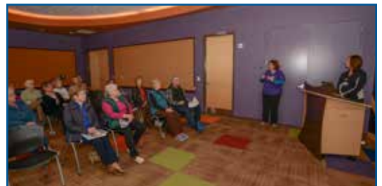
Professional Speaker Series in DIRECT