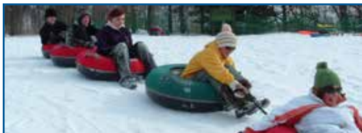
Winter Fun Family Outing

Mon., Jan. 22. – Thurs., Jan. 25 5:30 p.m. – 7 p.m.