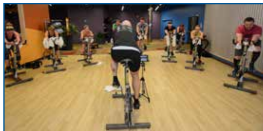
Triathlon Training in BLAST