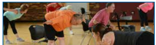
Fun Fitness in SOAR