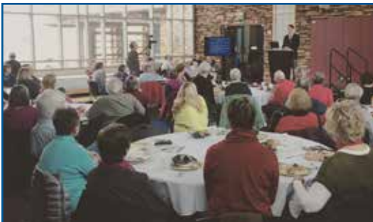
Interactive Heart Health Event in SOAR