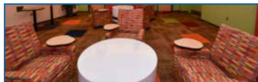
MINGLE in GATHER