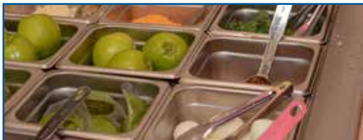
NOURISH by The Big Salad