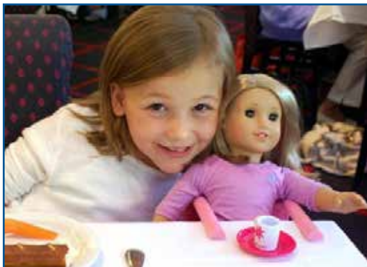
American Girl Breakfast Party