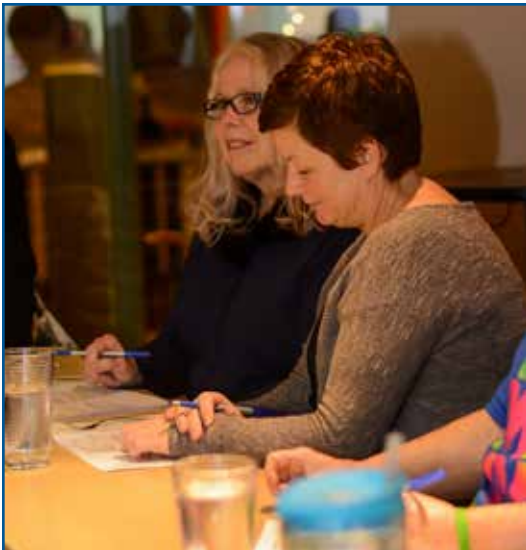
Cooking Matters for Adults in RELISH

Jan. 13 - Feb. 10 Sat. 10 a.m. – 12 p.m.