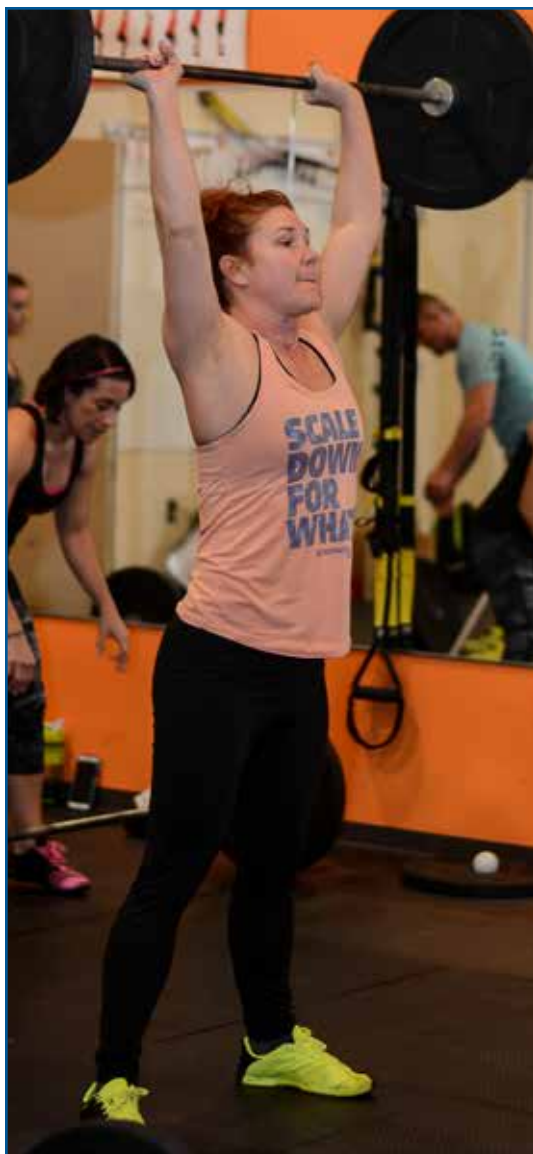
CrossFit in SPARK

6:30 p.m.–7:30 p.m. CrossFit 6:55 p.m.–7:55 p.m. Yoga: Basic (JM) 7:15 p.m.–8:55 p.m. Basketball: Adult Drop-In