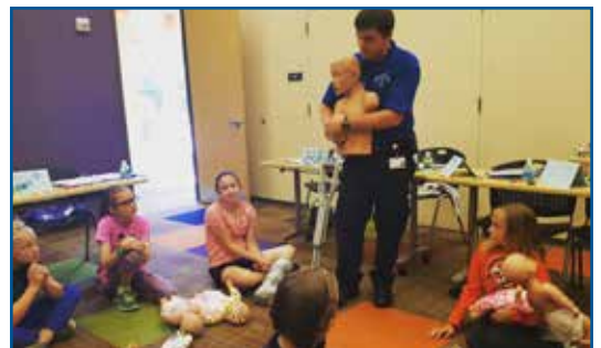
Babysitter Education Course