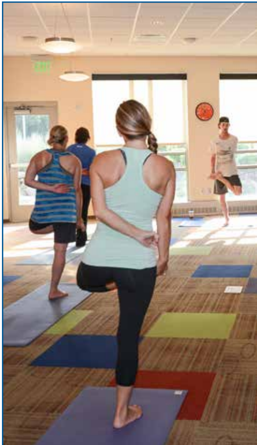
Yoga: Power in DISCOVER